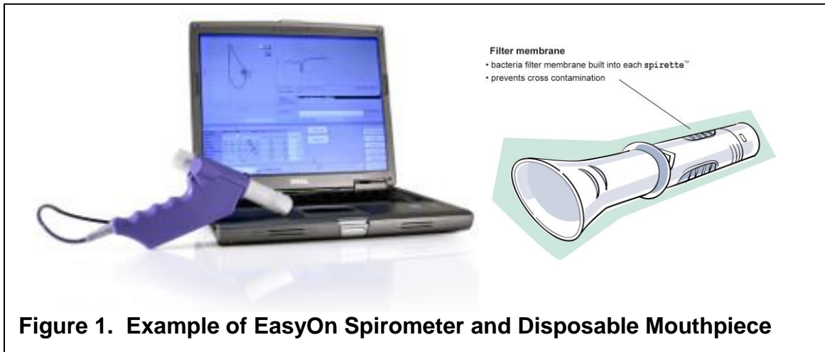
Figure 1. Example of EasyOn Spirometer and Disposable Mouthpiece

Our exclusion questions include those used in BOLD [Buist, et al. 2007] and PLATINO [Menezes, et al. 2005], multinational studies that enrolled over 14,000 adults over age 40 years for pre and post bronchodilator spirometry with only trained technicians. No adverse events occurred in either the BOLD or PLATINO studies. These exclusions are considered very conservative and these questions are not generally asked before spirometry is done in clinical practice. Note that exclusions for having a resting heart rate > 120 bpm is included.